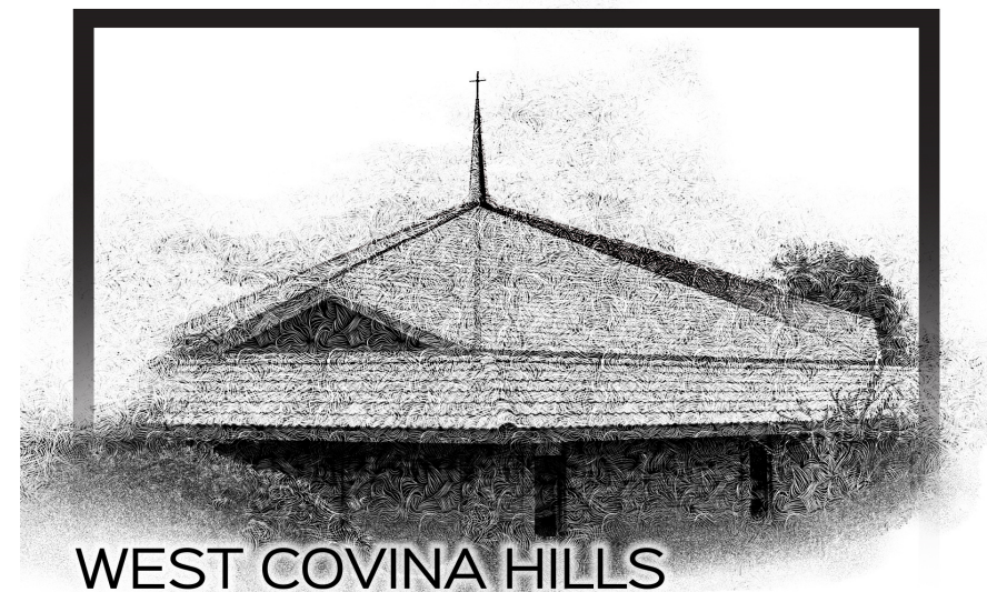
WEST COVINA HILLS