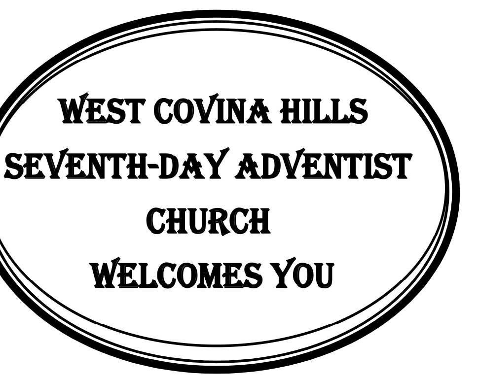
2015 THE YEAR OF PERSONAL EVANGELISM

Cell: 626-234-6269 E-mail: ellyx37@gmail.com