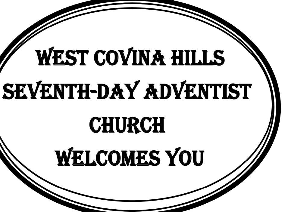
2015 THE YEAR OF PERSONAL EVANGELISM

"Prayer is the key in the hand of faith to unlock heaven's storehouse, where are treasured the boundless resources of Omnipotence." SC, pp. 94,95